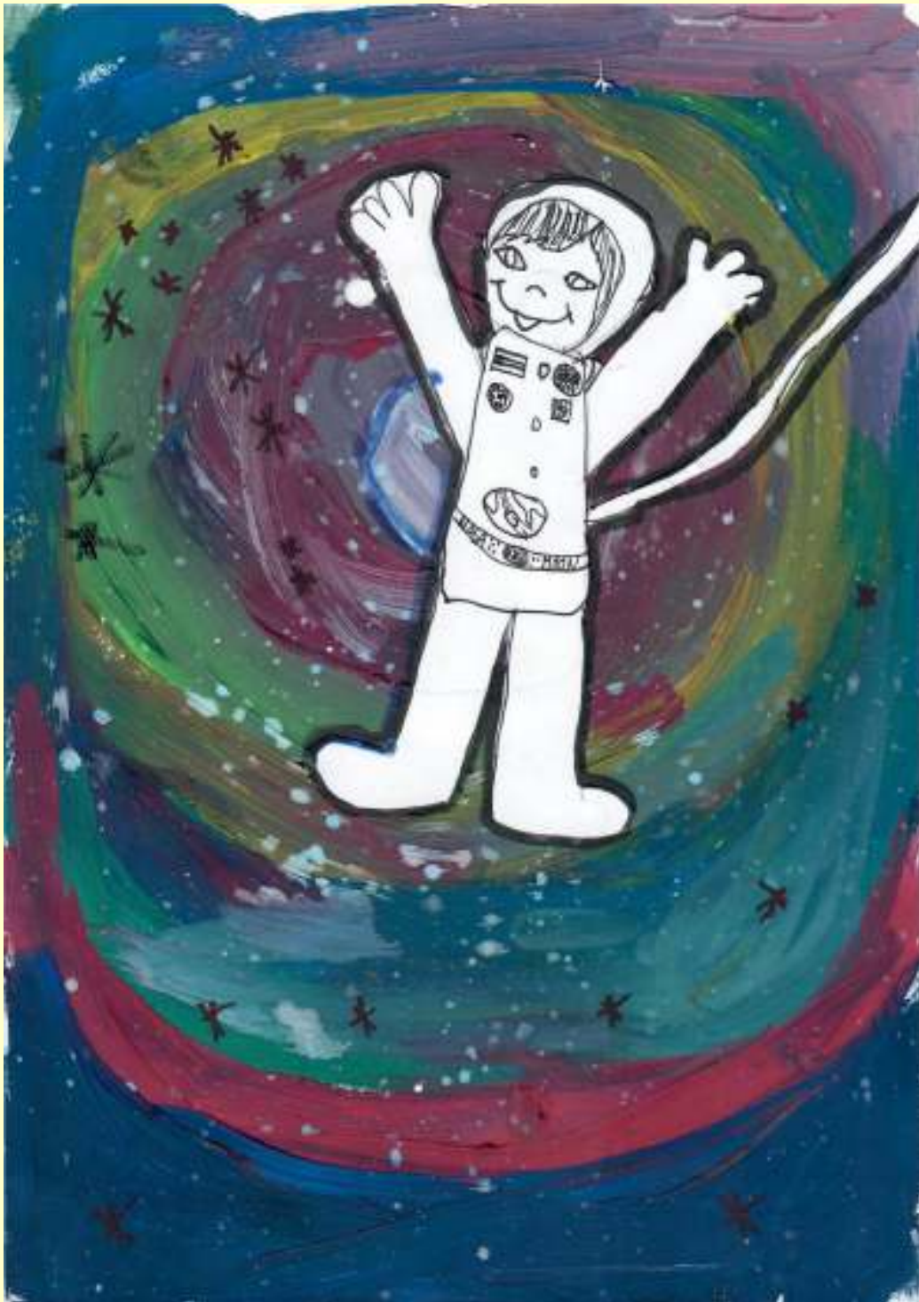
Being an astronaut is challenging – illustration by 4.b class