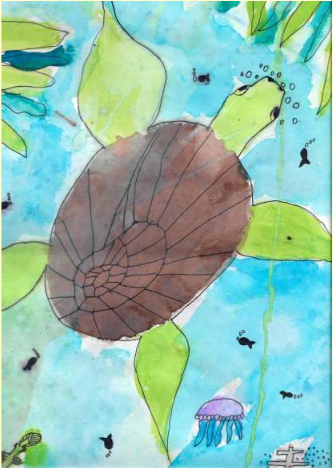
Illustration by 4.b class