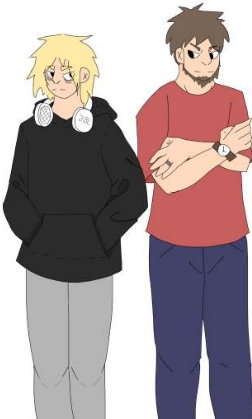
Illustration by Petra Buchová, 8.a class